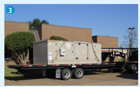
Single-piece unitized base rigging