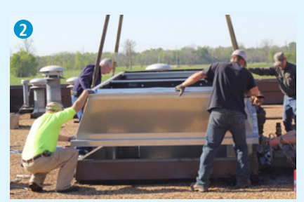
Lift and set of new retrofit curb