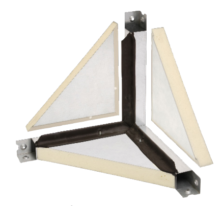
Gasketed frame channels and removable double-wall, foam injected panels provide superior strength, low air leakage, and high IAQ.