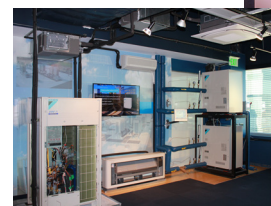
Modular Solutions - Chiller Plant