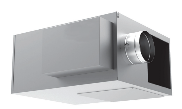
MQFVI5 Series Fan Air Terminal