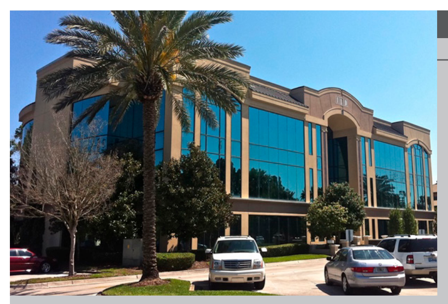
Los Verdes features 12 suites ranging from 1100 to 6500 square feet.