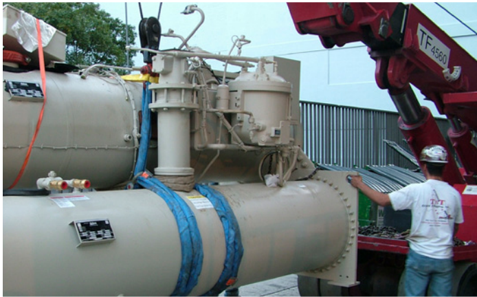
The new Daikin centrifugal chiller arrives partially disassembled for installation in the ground floor of the 823 Congress building.