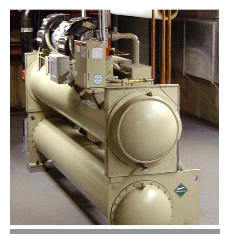
The two compressors of the Magnitude chiller operate on a common refrigerant circuit, improving system reliability.

When the budget allows, we can integrate the MicroTech II chiller using BACnet®, LoNTALK® or Modbus® protocol thanks to the Protocol Selectability™ feature of the unit controller."