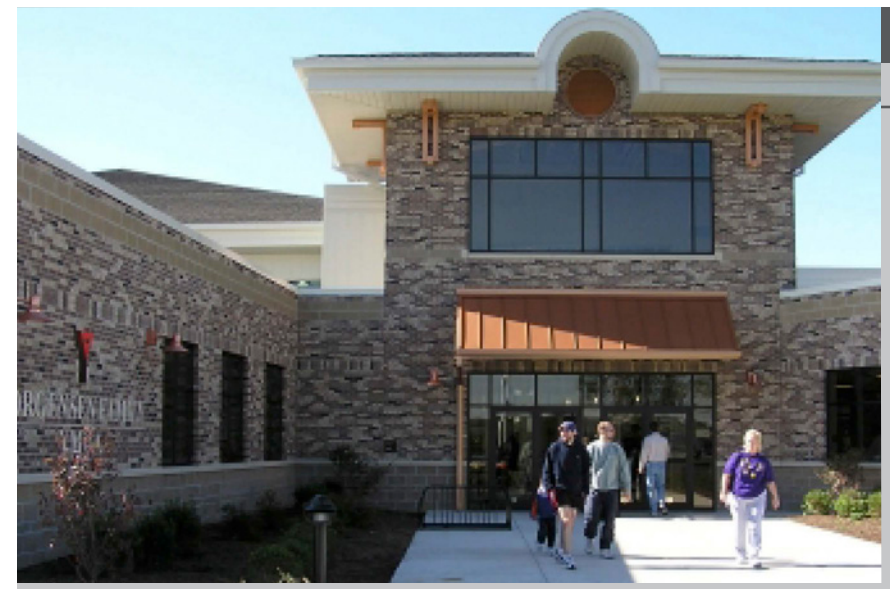
The Jorgensen YMCA in Fort Wayne, Indiana, boasts some high impact-and highly desired-sports and community amenities.