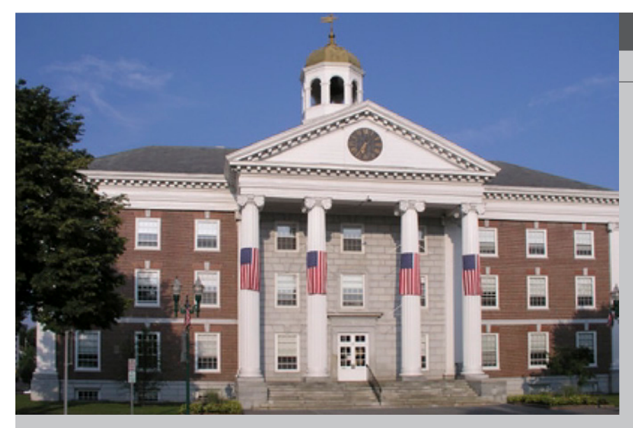
Auburn, New York, can boast of a Colonial Revival beauty on the National Register of Historic Places. Designed in 1930 by the Boston architectural firm Coolidge, Shepley, Bulfinch & Abbott