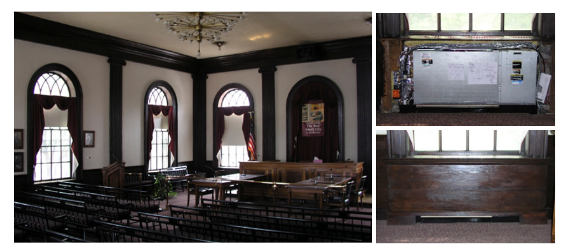
The contractors were able to take advantage of the building's features to "hide" the geothermal system. The ornate grillwork used to hide the original radiators were re-used to house the Daikin heat pumps.