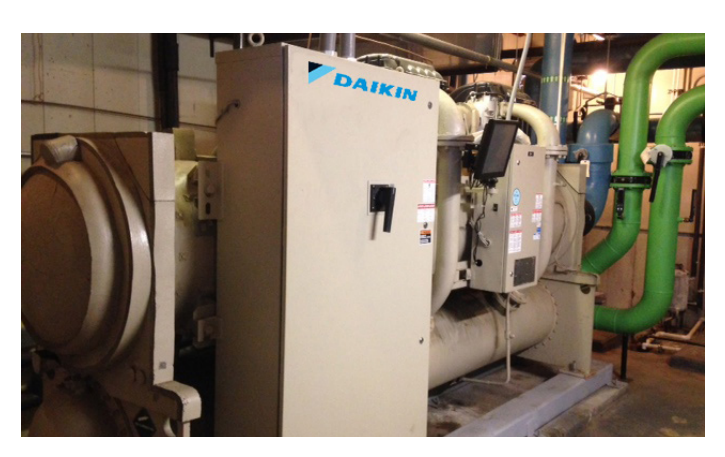
Daikin Magnitude chillers contribute to impressive energy savings

"The chiller has been performing flawlessly with no real issues to speak of. We have it on a yearly maintenance program that keeps it running at peak performance and provides us with confidence that the system will remain