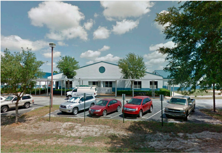
West Hernando Middle School felt effects of outdated HVAC technology chose Daikin for DOAS and VRV solutions that deliver comfort for occupants and a quick ROI for the school district.