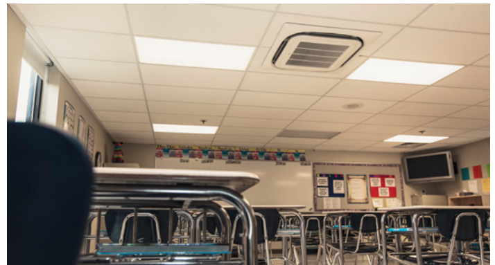
Daikin provides independent zone-based heating and cooling solutions to building structures that can't accommodate traditional HVAC systems.

"The building structures do not accommodate traditional HVAC systems and we didn't want to just replace air handling units," said Van de Boogaard. "The new Daikin HVAC equipment and electrical system