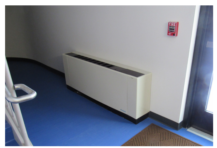
VIP also incorporated Daikin Enfinity console WSHPs for supplemental heating and cooling in specific areas in the new building.

Based on the customer's past experience with the longevity of the WSHPs made by Daikin Applied (formerly known as McQuay International) in the first building, VIP looks forward to reliable service with the new WSHPs. "Of the 25 total units in our first building, we have had to make very few replacements over the years," Yasewicz says. The new WSHPs were integrated into the building automation system (BAS) that serves both buildings. VIP made an upgrade to its BAS a few years ago along with adding variable speed motors on the original WSHPs to reduce its operational costs.