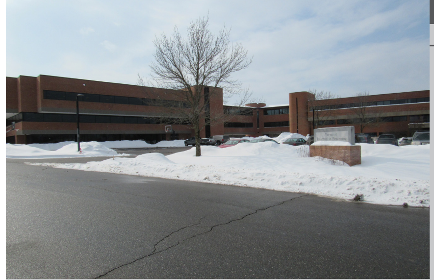
Vermont Information Processing's three-story building contains office space as well as a data center located on the third-floor.