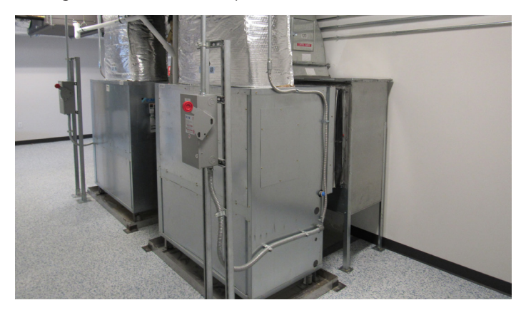
Two large capacity WSHPs with hot gas reheat provided solutions for VIP's data center space requirements.

Thermal Environment closely coordinated with Daikin Applied on the manufacturing specifications and worked with mechanical contractor New England Air Systems on the installations that happened during building construction. Final completion occured late 2014.