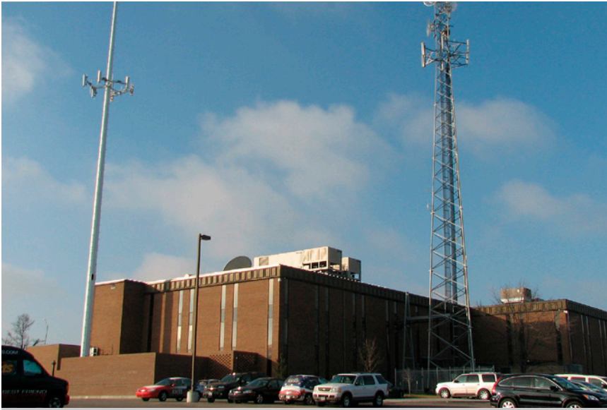
This building houses all eight of the Kansas City radio stations owned by Entercom Communications