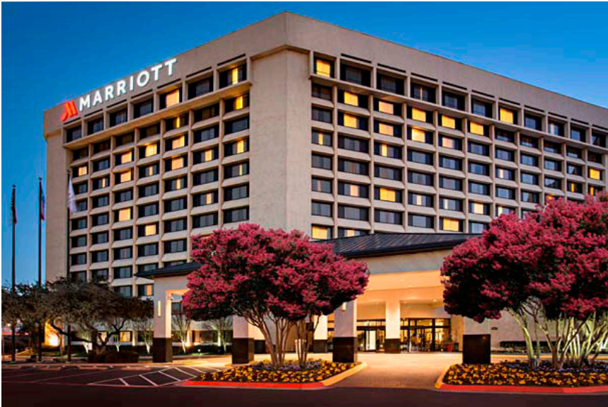
The ENERGY STAR earning Marriott Quorum sits among premier restaurants, entertainment, and shopping in the North Dallas area and receives rave reviews from guests and businesses.