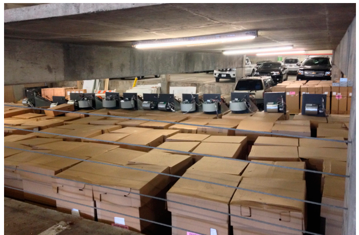
Vertical stacked fan coils line the hotel parking garage where Comfort System's technician teams performed preparation work on the new units.

In addition, Daikin Applied supplied 3 custom Skyline outdoor air handling units for supplemental air handling in the hotel's public spaces that include hallways and elevators. "Like the fan coils, these units also replaced McQuay equipment and are used to feed chilled water in conjunction with energy recovery ventilation (ERV) systems by another manufacturer to reclaim energy from the building's exhaust,"