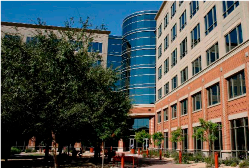
Arizona Department of Environmental Quality