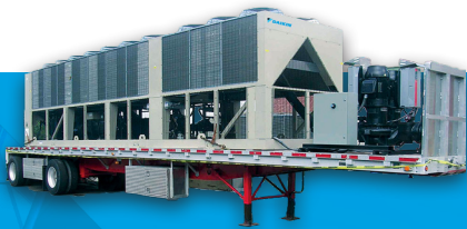
CHILLERS & COOLING

RELIABLE RENTAL SOLUTIONS WHEN YOU NEED THEM MOST.