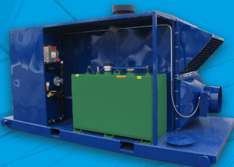
HEATING & BOILERS