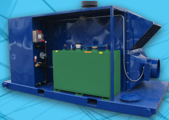
HEATING & BOILERS