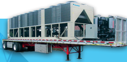
CHILLERS & COOLING